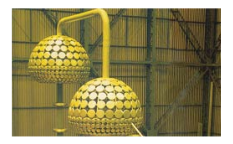
On-site testing of a power cable